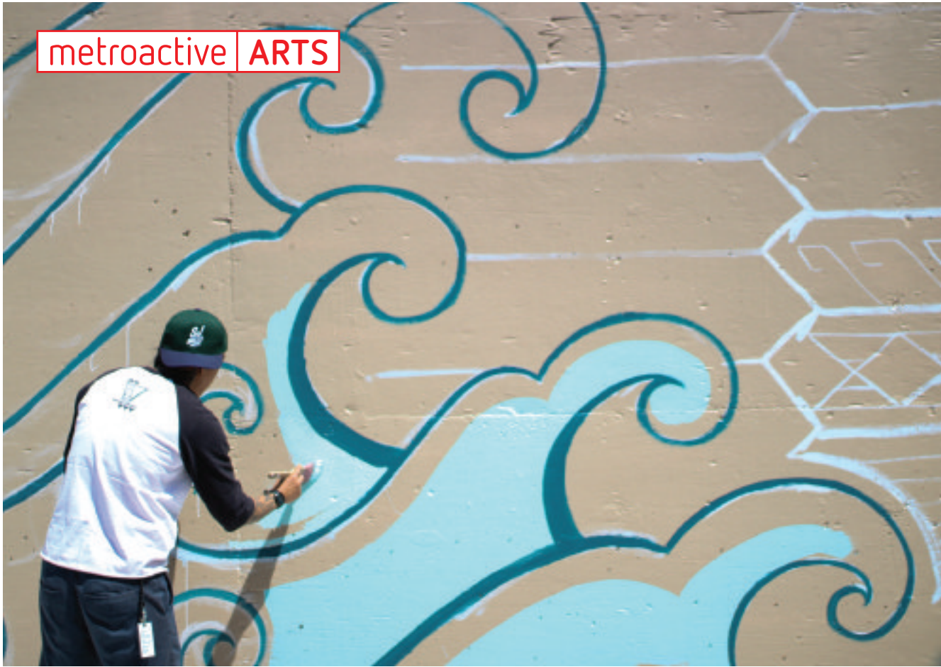
Ethan Gregory Dodge

SEA CHANGE During SJ Walls, tides of paint turn the city into a canvas.